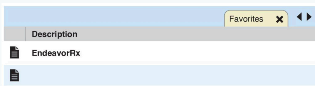
Example of the Favorites tab

Once a product has been added to the product database, it can be saved as a favorite. To save a favorite, create a properly formatted prescription, then drag the completed prescription to the field labeled Favorites at the top of the window.